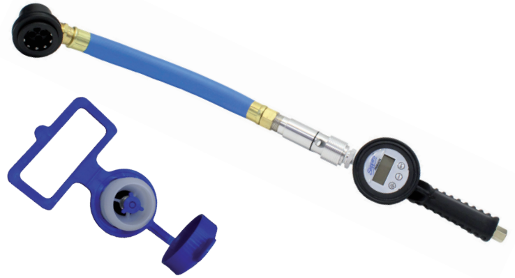
Digital Inflator with TX Chuck for use with our Heavyweight Zebra Airbags