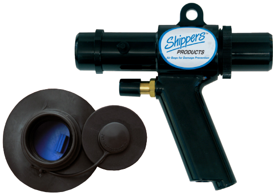
Super Flow Inflator for use with our Lightweight Zebra Airbags